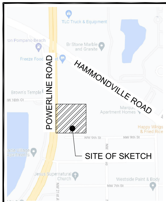
LOCATION MAP: NOT TO SCALE

SAID LANDS LYING AND SITUATED IN THE CITY OF POMPANO BEACH BROWARD COUNTY, FLORIDA AND CONTAINING 5,202 SQUARE FEET, MORE OR LESS.